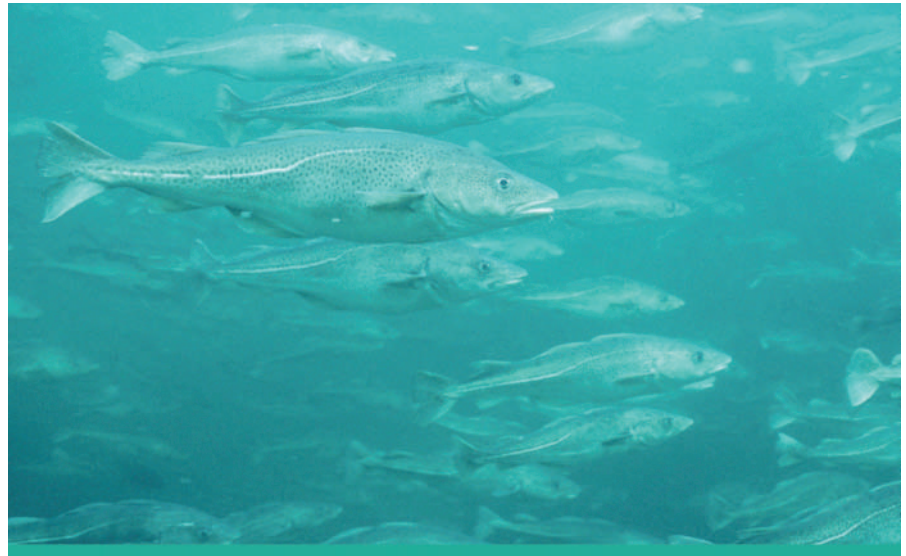
Figure 1 Atlantic cod: test case for studying human-induced genetic change.

Having been documented repeatedly in exploited populations, it is incontestable that fishing can lead to significant changes in life-history traits, such as age and size at maturity. The question is whether these changes are phenotypic (reflecting non-genetic variation in physical or behavioural characteristics) or genetic. Consider age at maturity, for instance. As the density of a population declines, relaxed competition for food and