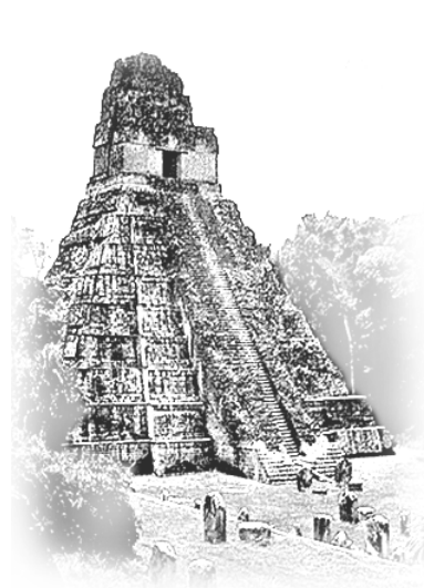
Maya site of Tikal (ca. 800 AD)

That large-scale changes in ecosystem function can lead to dramatic societal changes – including population dislocations, urban abandonment, and state collapse (a process that, at a conceptual level, is perhaps akin to evolutionary suicide) – has been documented in several outstanding case studies drawn from New