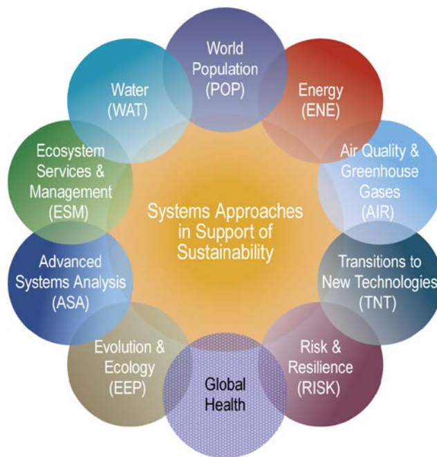
Figure 2: The IIASA research themes.

This framework provides both the foundation for the institute’s research direction over the next five years and the necessary flexibility to modify IIASA activities to accommodate changing scientific or policy priorities.