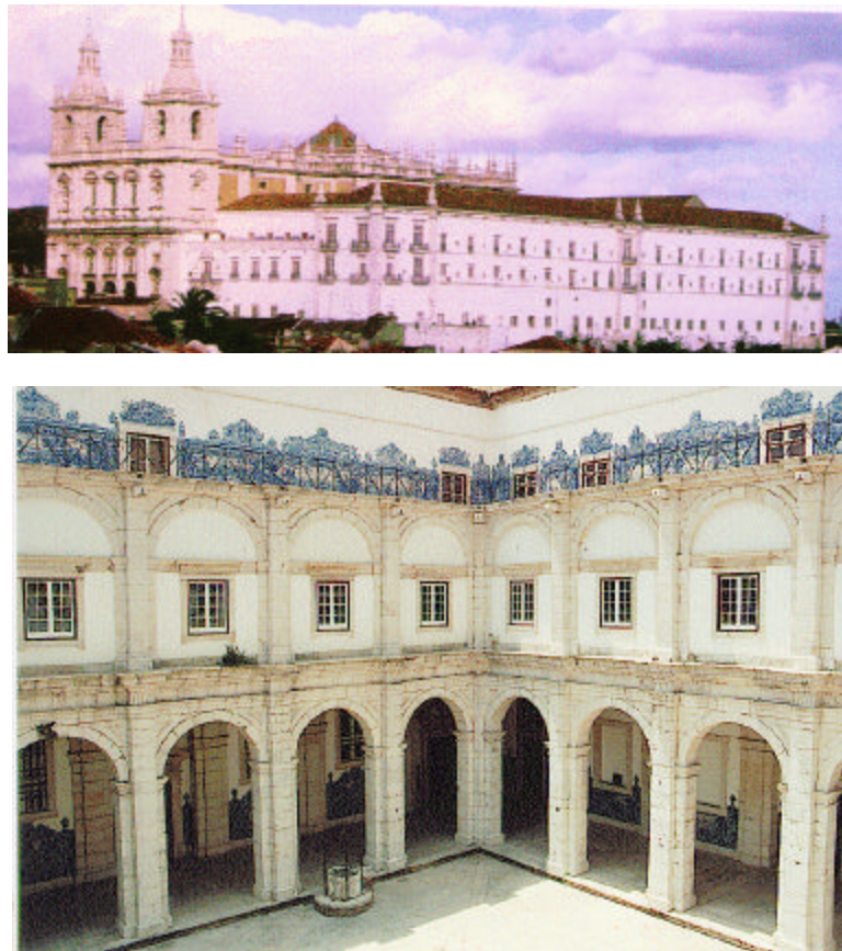
Figure 1. S. Vicente de Fora: General view (top), Cloisters internal view (bottom)

The JRC, the General Directorate for Monuments and the National Laboratory for Civil Engineering in Lisbon jointly developed a project dealing with the vulnerability assessment of historical structures and with the validation of retrofitting solutions and techniques. A full-scale model of part of the S. Vicente de Fora monastery in Lisbon [1] was constructed, tested and retrofitted at the ELSA laboratory. It was demonstrated that rather simple and economical retrofitting solutions, based on anchored ties with continuous bond, substantially increase their seismic performance. Furthermore, the proposed retrofitting techniques maintain the original architectonic and structural layouts of the construction.